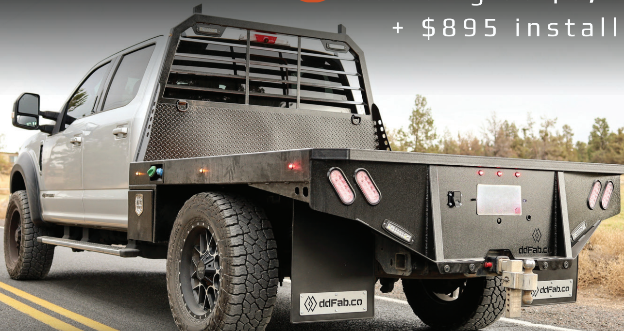
Shown: Standard Base Model + Toolboxes + Cargo Ears

Standard Model: Starting at $5,795 + $895 install