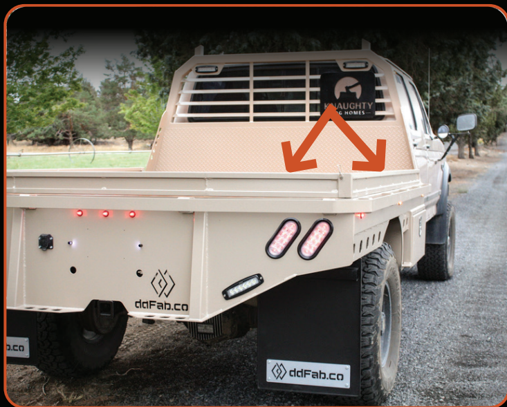
Bed Rails $550