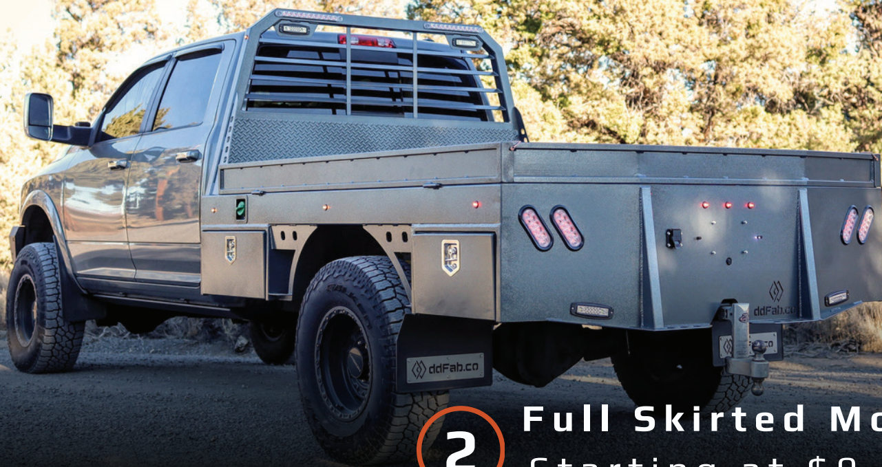
Shown: Full Skirted Base Model + Bed Rails

Full Skirted Model: Starting at $9,425 + $895 install