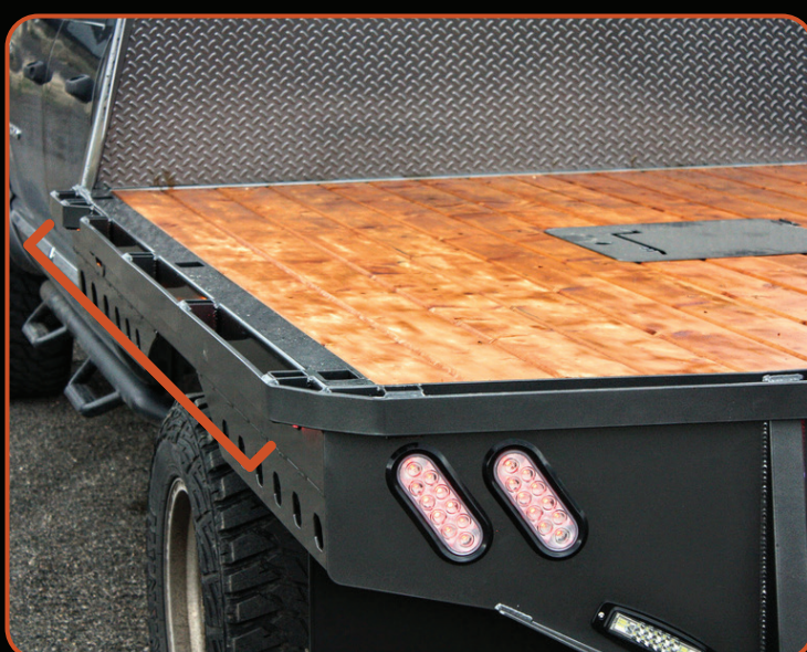
Rub Rails $375