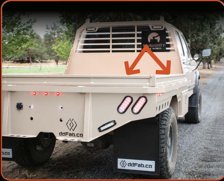
Bed Rails $550