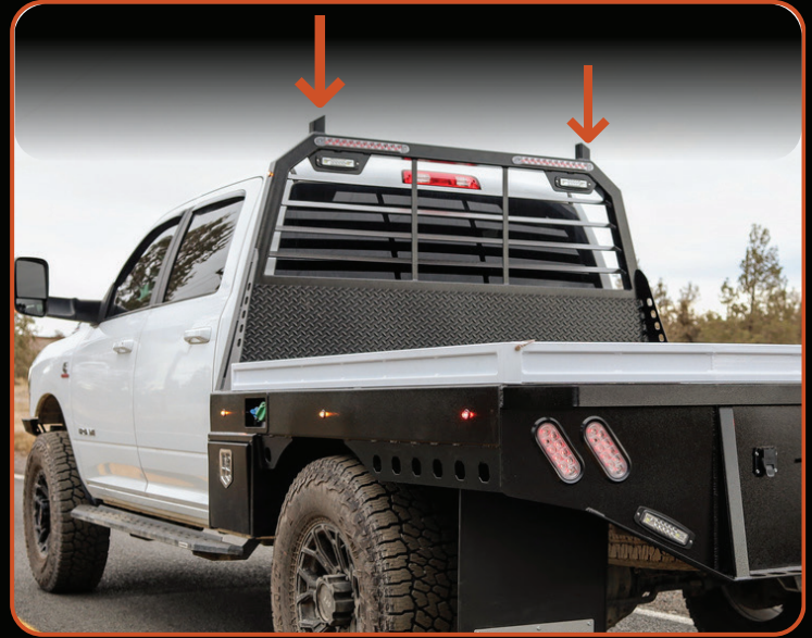
Cargo Ears $30 (Pair)