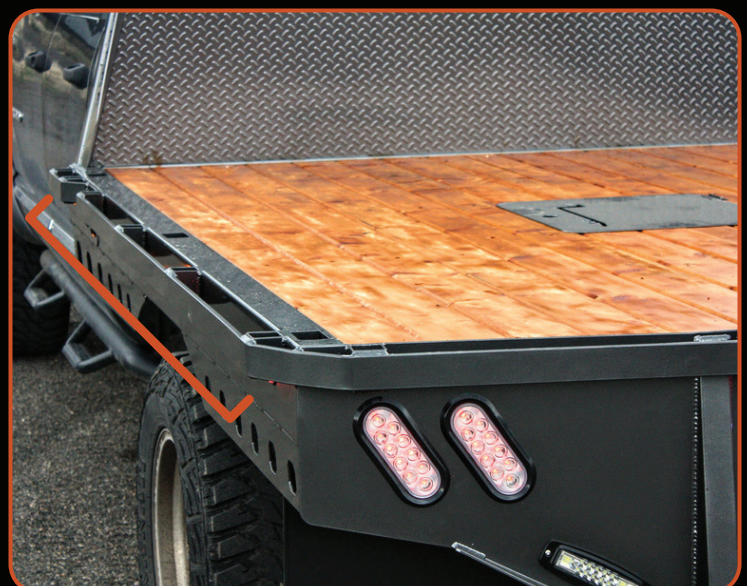
Rub Rails $375